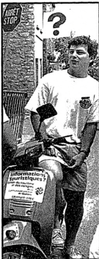
the battles between the warring colonists of New France and New England on a room-size model of Old Quebec. (Daily 10 A.M. to 6 P.M.; admission $2.80, students and people over 65, $1.60.)

Changing of the guard at the Citadelle, below; mobile tourist information unit, left.