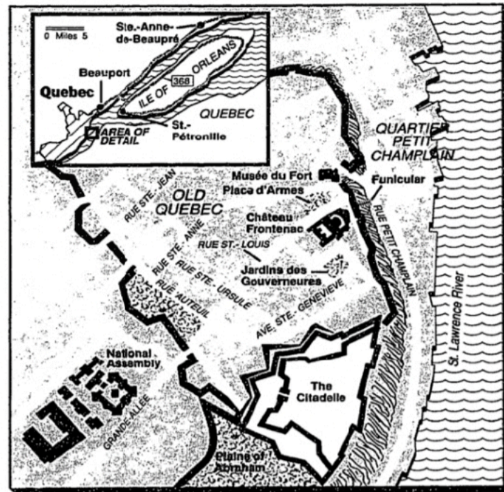
The New York Times/Aug. 13, 1989

Several small tourist hotels line an historic square, Jardins des Gouverneurs, behind the chateau where the United States consulate is situated. The Château Bellevue, in a series of attached row houses, has free parking and 57 rooms, some with river views at $55 to $65 for two (16 Laporte Street; 418-692-2573). The tidy nine rooms of Manoir Ste.-Geneviève, in a white Victorian-style house, cost $65