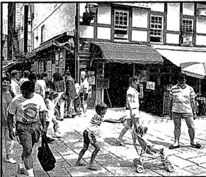
Visitors near the Place d'Armes.